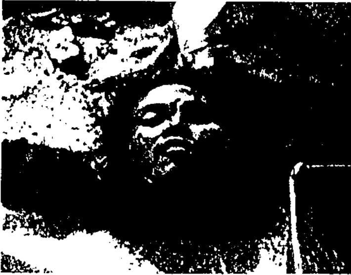
MASARIKU NETWORK Ambon, the Moluccas March, 2001