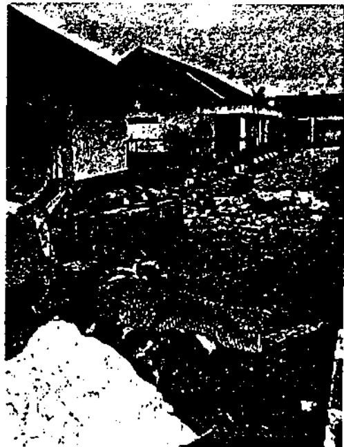
MASARIKU NETWORK Ambon, the Moluccas March, 2001