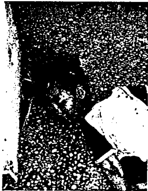
MASARIKU NETWORK Ambon, the Moluccas March, 2001